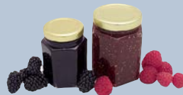
JAMS & JELLIES