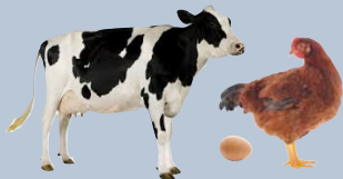
MEAT & EGGS