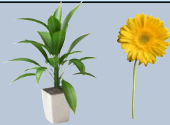
PLANTS & FLOWERS